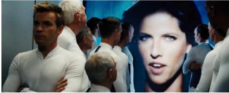
Figure 2 -- The Island : Lincoln Six Echo is a rebel clone.

2) **What details do you notice about the film still?