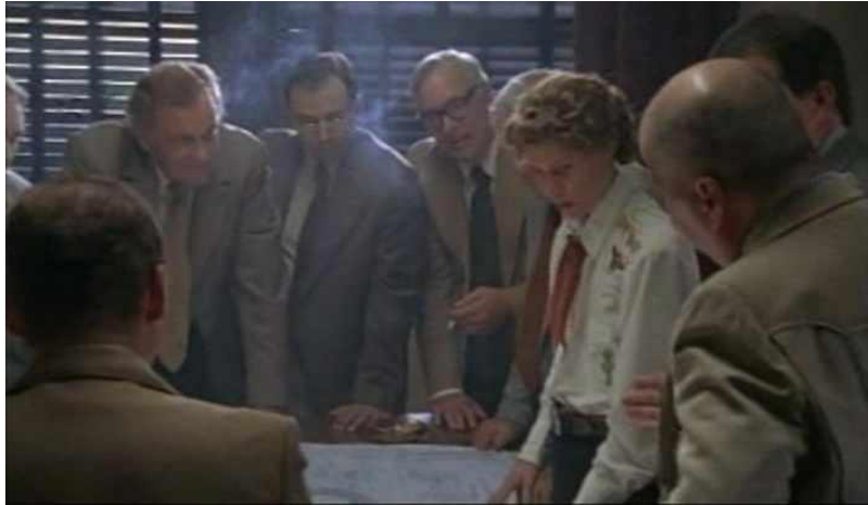
Figure 8: Temple Grandin as architect shows off her design for a more humane slaughterhouse.

2) **What details do you notice about the film still?