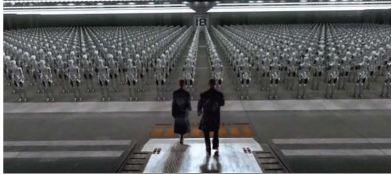
Figure 5: I, Robot -- Human vs. machine. One of these robots is a suspect, but which one?

2) **What details do you notice about the film still?