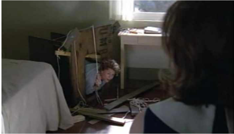
Figure 7: Temple Grandin's design for a 'squeeze machine,' which led to a patented device that is still used to treat autistics.

2) **What details do you notice about the film still?