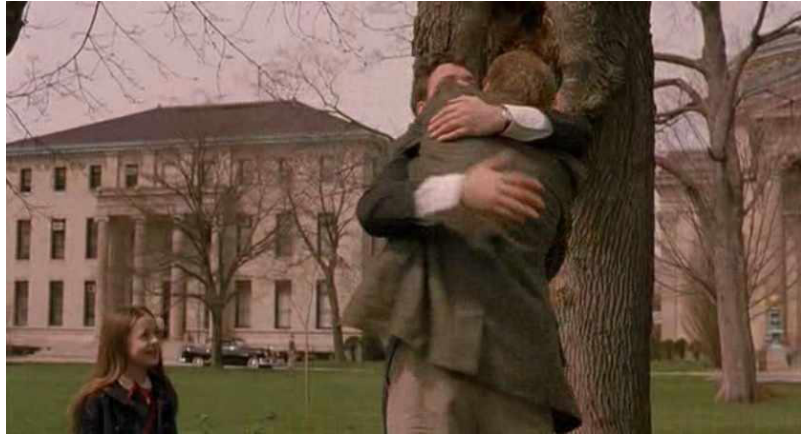
Figure 10: John Nash (Russell Crowe) greets his imaginary friends early in the film, A Beautiful Mind .

2) **What details do you notice about the film still?