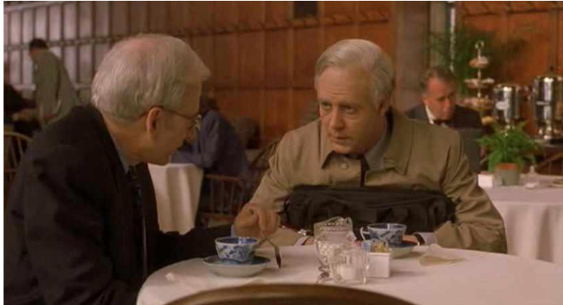
Figure 13: In the climax of the film, an older John Nash is told of his Nobel Prize after decades of obscurity and struggle with his mental illness.

2) **What details do you notice about the film still?