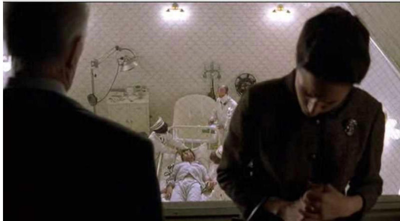
Figure 12: In a powerful scene, the film show insulin shock therapy used to treat John Nash's schizophrenia while his wife Alicia (Jennifer Connelly) and psychiatrist look on.

2) **What details do you notice about the film still?