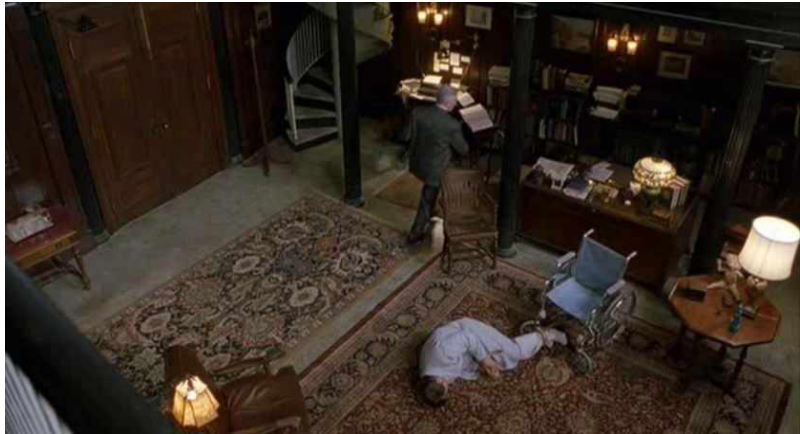
Figure 11: After a severe episode of paranoia, John Nash is treated for schizophrenia by his psychiatrist.

2) **What details do you notice about the film still?