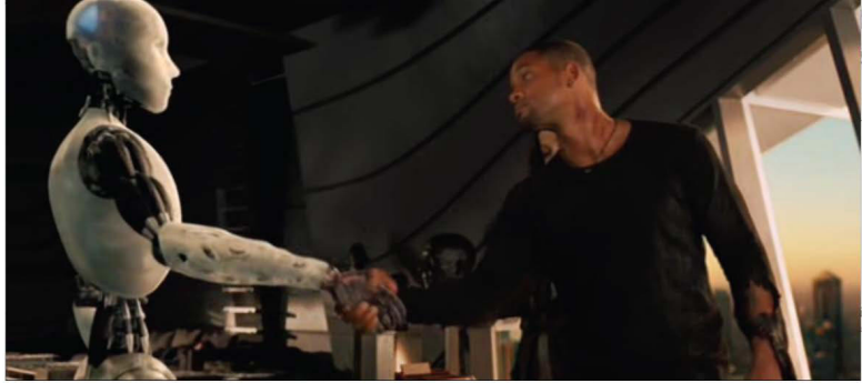
Figure 6 -- A happy ending? Del Spooner (Will Smith) makes peace with a machine at the close of I, Robot .

2) **What details do you notice about the film still?