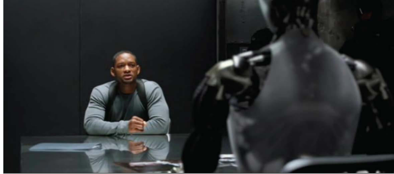
Figure 4: I, Robot -- Del Spooner (Will Smith) interrogates a robot who is a murder suspect.

2) **What details do you notice about the film still?