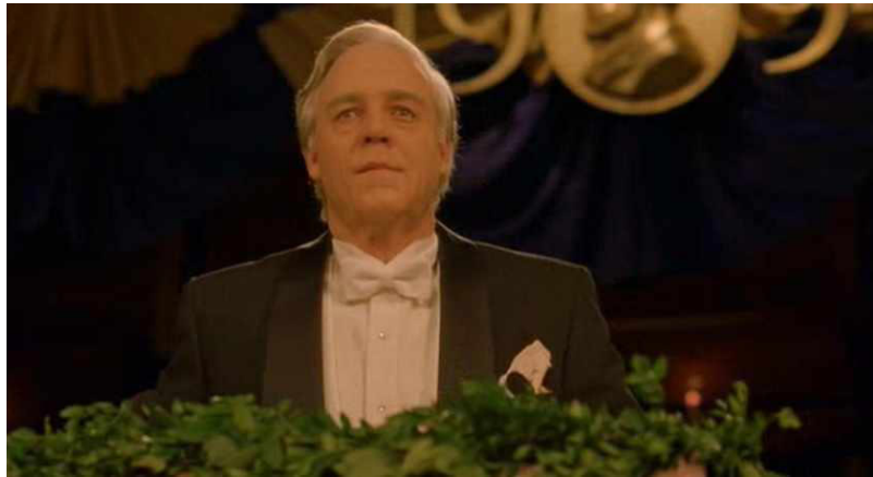
Figure 14: Triumph -- John Nash accepts his Nobel Prize in a moving speech at the end of the film, A Beautiful Mind .

2) **What details do you notice about the film still?