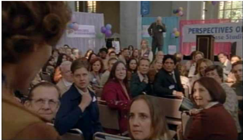
Figure 9: In an emotional scene at the end of the film, we see Temple Grandin emerge as a spokesperson and advocate for the rights of autistics.

2) **What details do you notice about the film still?